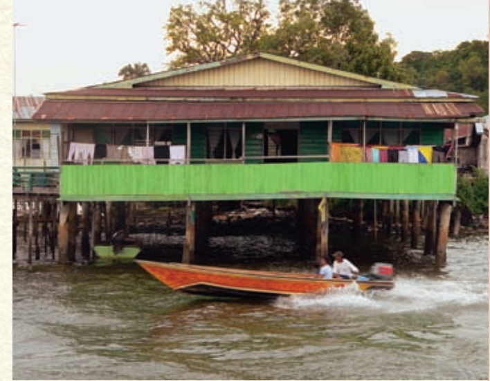
KAMPUNG AYER, BRUNEI

► After lunch you can relax at our hotel; join a tour to the Royal Polo Grounds and see the hundreds of polo horses owned by His Majesty, the Sultan of Brunei; or take a boat trip into the Ulu