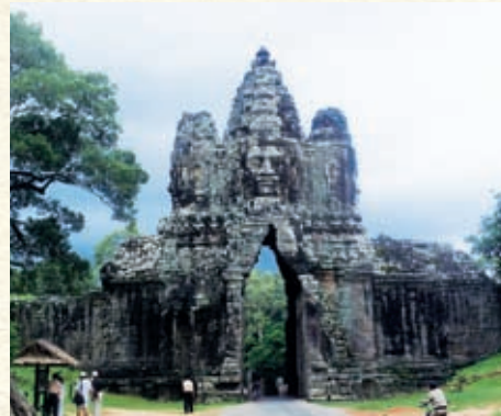
ANGKOR WAT, CAMBODIA

► This evening enjoy a dine-around dinner and select from the restaurants within our hotel.