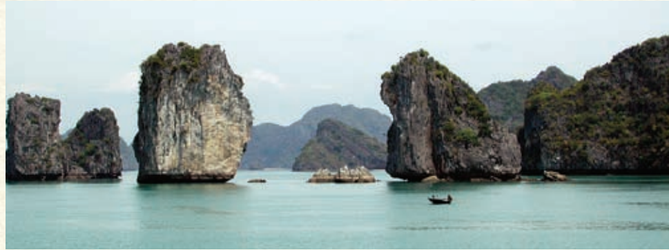
HALONG BAY, VIETNAM

Hanoi is without doubt one of Asia's most beautiful cities – wide tree lined