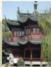
YUYUAN GARDENS, SHANGHAI