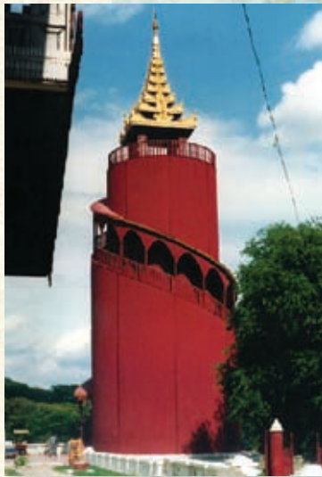
MANDALAY PALACE, BURMA

▶ Alternatively, you may like to take a full day trip to the Cambodian capital,