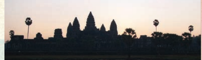
ANGKOR WAT, CAMBODIA

visit Siem Reap village for some shopping.